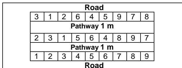
Figure 2. The sketch of experiences to determine the optimal nutrition space of the plant

At each variant/repetition was determined the number of plants/ha, was evaluated plant height, number of ramifications, the total weight of the plant (stems, leaves, flowers), was established production of fresh and dry herb and rate of seed / ha. Results were subjected to statistical analysis.