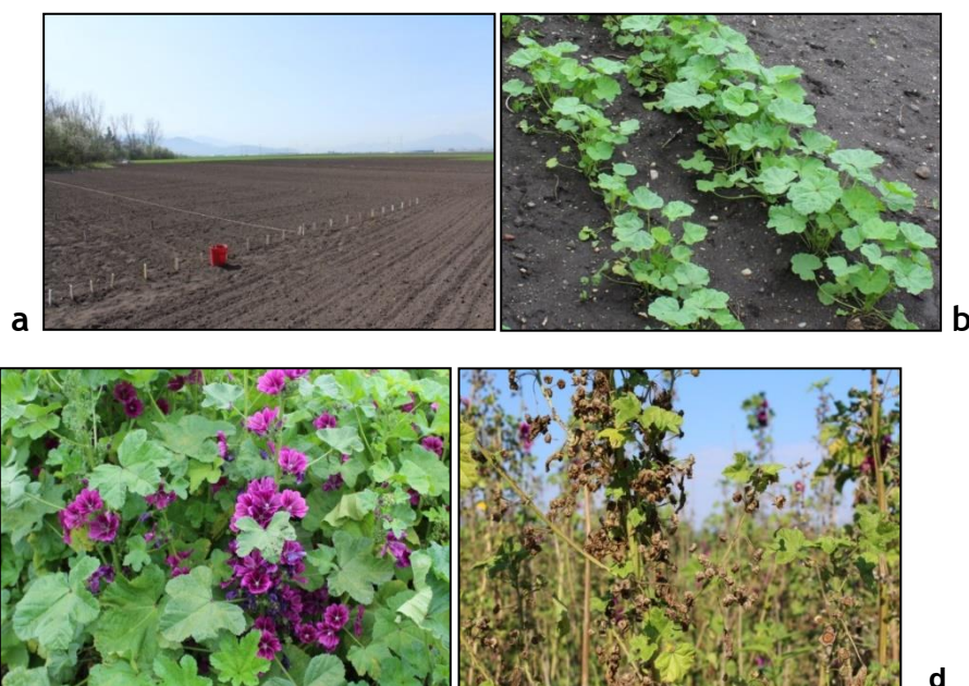
Photo 1 a,b,c,d. Malva sylvestris L. species from crop establishment to herb harvest

As shown in Table 1, were made measurements on plant height, the results are different on variants/repetitions with values ranging from 94 cm (V5R1) to 145 cm (V3R2) and measurements concerning the number of ramifications of each plant, number between 10 (V5R1) and 25 (V3R3) ramifications/plant.