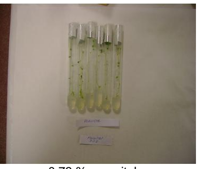
0.73 % mannitol