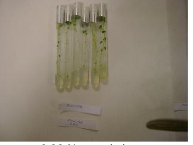
0.36 % mannitol