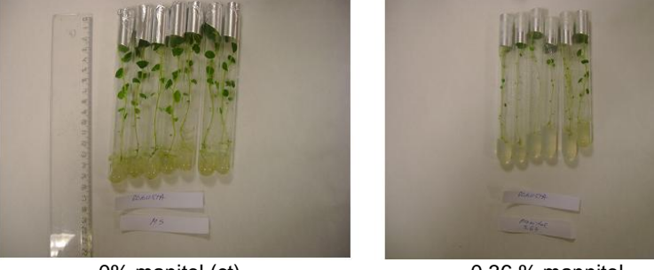
0% manitol (ct)

Fig. 3. Plantlets developed under the influence of mannitol concentrations for Ruxandra variety