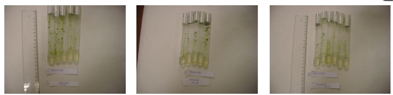
1.09% mannitol 1.46% manitol 1.92% manitol Fig. 4. Plantlets developed under the influence of mannitol concentrations for Robusta variety