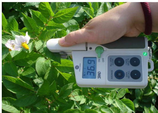
Fig.1 The leaf chlorophyll content monitoring with SPAD 502 Plus Chlorophyll Meter