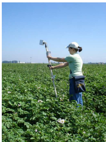
Fig.2 The canopy reflectance monitoring with CropScan multispectral radiometer

The crop potato fall in plants group with high requirements for nutrients. Therefore Desiree was fertilized with NPK complex (15:15:15) – 510 kg/ha.